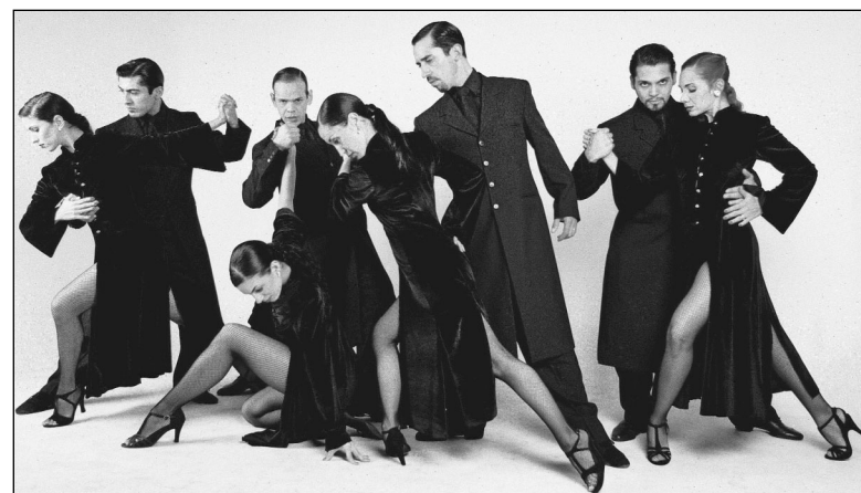
PASSIONATE: It takes eight to tango in Corporacion Tango's new show.