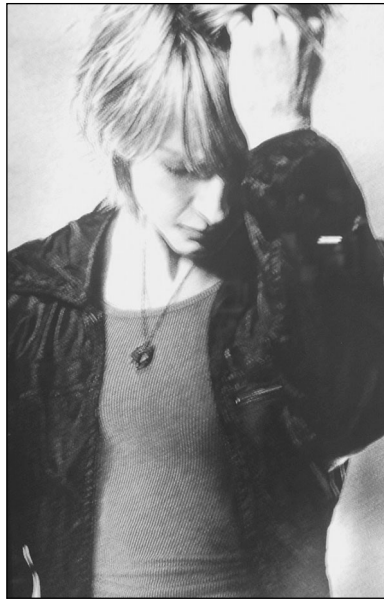
BRAVE ONE: Jodie Foster.