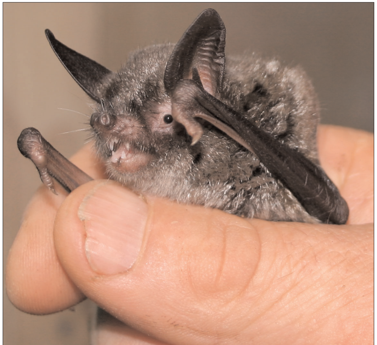
SAFE HAVEN: Auckland Zoo's newest arrivals once numbered in the millions, but there are only 50,000 left.